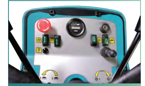
Minimalist design of the control pane