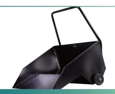
waste bin with split design