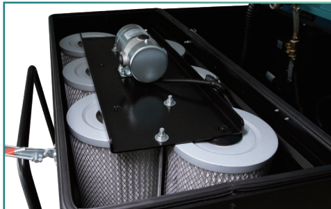
Extra large 6-barrel filtration system