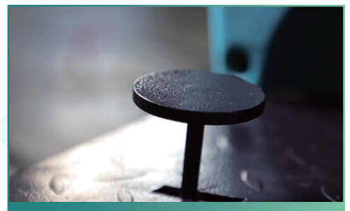
Ergonomically designed duster foot pedal