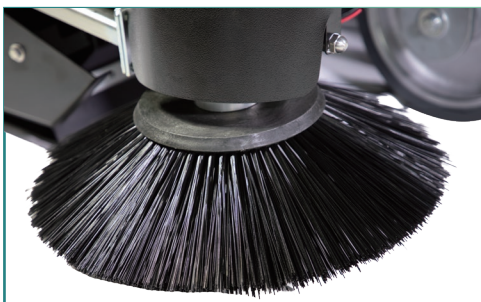
Front nozzle with atomisation system