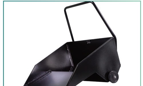
waste bin with split design