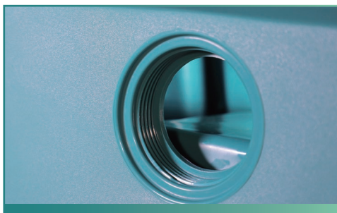
Sealing thread design in solution water tank inlet