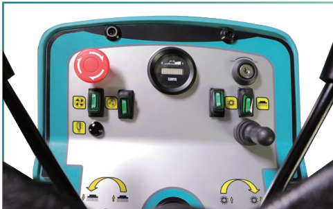
Minimalist design of the control panel