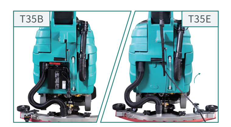
Battery Cable version