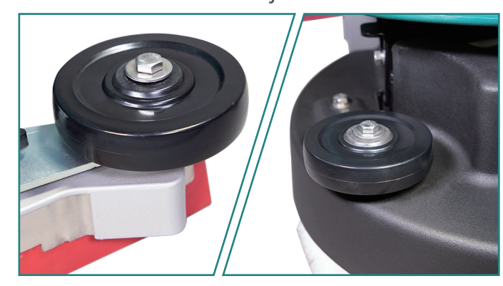
Squeegee assembly/brush cover are both collocated with anti-collision design