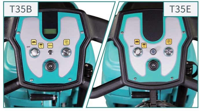
Highly integrated control panel